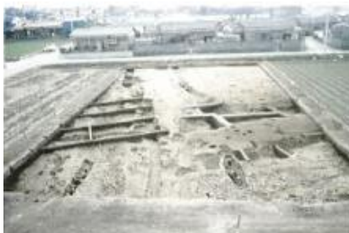
Intersection at the remains of the Kokufu