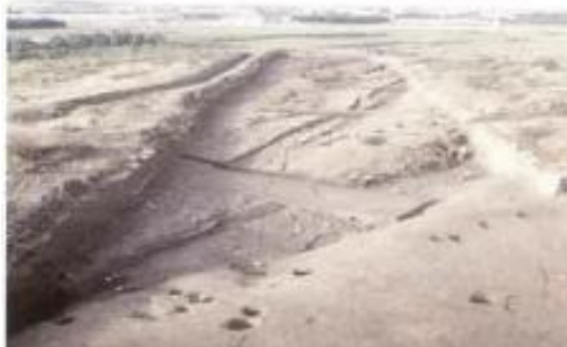
Denro road next to Hebonoki remains: paved with stones, narrow and winding.