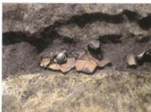
Many earthenwares were discarded in the street drain. These are mainly from the 9th century.