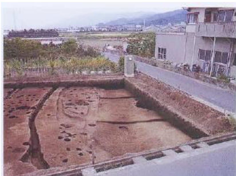
The remains of the Kokufu The Ancient Road passes beneath the present road. By the Cut Slope method, the surface is a little depressed.

book about law and customs; mainly completed in 927)" are not yet identified or discovered. These should be our enormous challenges.