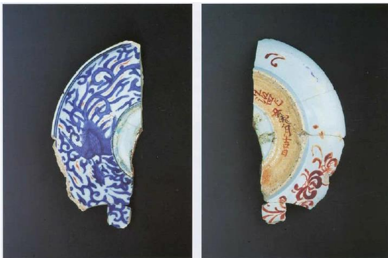
Phoenix designed pottery

A fragment of vessel-like pottery (above) was excavated at the Sanbonmatsumachi Remains in 1989. We regard it as a stand bonded to something like a bowl or a barrel because of the silvering round trace on the inside surface.