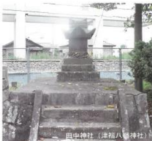
Tanaka-jinja Shrine (Tsubuku-hachiman Shrine)