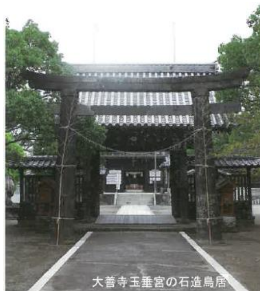
Stone Torii Gate of Daizenji-tamataregu Shrine

Yoshimasa gave generous protection to the shrine by giving the temple territory of 300 kokus in 1601 and donating a temple bell in 1604. The stone torii gate was offered by Tadamas, the fourth son and the successor, in 1618. There is an inscription of Tadamas's name on a pillar on the right side when facing the shrine and other inscriptions of some names and the donation time (spring, Genna 4 th [1618]) on the pillar on the left side. This torii, municipally designated as cultural property, is the second oldest gate after the one of Kitano-tenmangu Shrine, constructed in 1607 and prefecturally designated as cultural property.