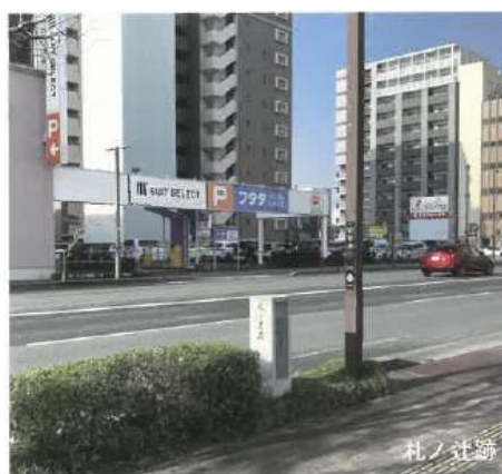
Former Fudanotsuji Site

Later, during the reign of the Arima family, Fudanotsuji, meaning a crossroad with information boards, became the starting point of Yanagawa Okan.