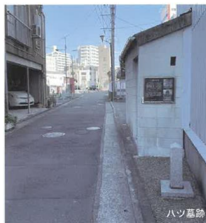
Monument of the Eight Graves

In 1591, Hidekane invited Rinkei, the chief priest of Mount Kora, and Ryoha, his son, to the castle for a drinking party. When they left the castle, Hidekane had his samurais kill these two and their eight retainers running away to Kora Mountain. Eight graves were built at the place, where the eight were attacked, on the north side of today's Nihon Seimei Building. A monument was built after the gravestones had been moved to the precinct of the Io-ji Temple due to the construction of the building in August 1980. The path they run on has existed since the Middle Ages.