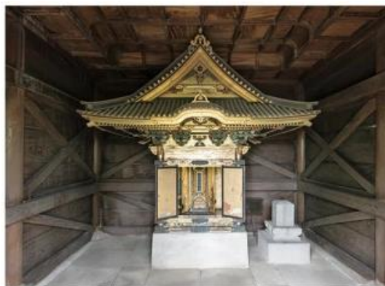
Choju'in Mortuary Tablet Hall