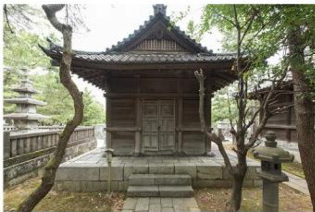
Shunrin'in Mortuary Tablet Hall