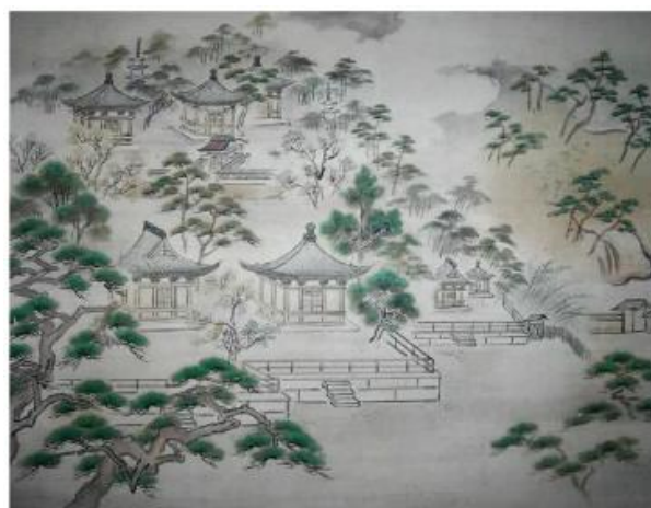
Ancestral Halls on the Diagram of Konanzan