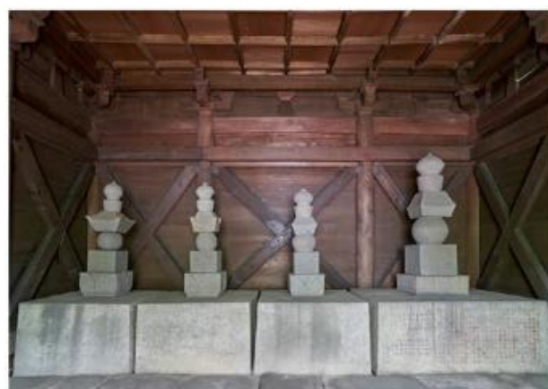
Pagodas in the Shunrin'in Ancestral Hall

Located on the northeast side of the above-mentioned hall, this has a square hip roof and a platform made of large square-cut granite stones. It houses four pagodas of Toyouji, the first (1569-1642: his Buddhist name was Shunrin'in), his wife (Choju'in), his son Tadayori, the second (Keirin'in), and his great-great-grandchild Yorimune, the fourth. The rightmost pagoda is the largest and bears an inscription about its history of construction on the platform. And, an inscription on a stone lantern placed in its front indicates that it was built in 1643, and suggests that the hall was constructed on the occasion of Toyouji's burial.