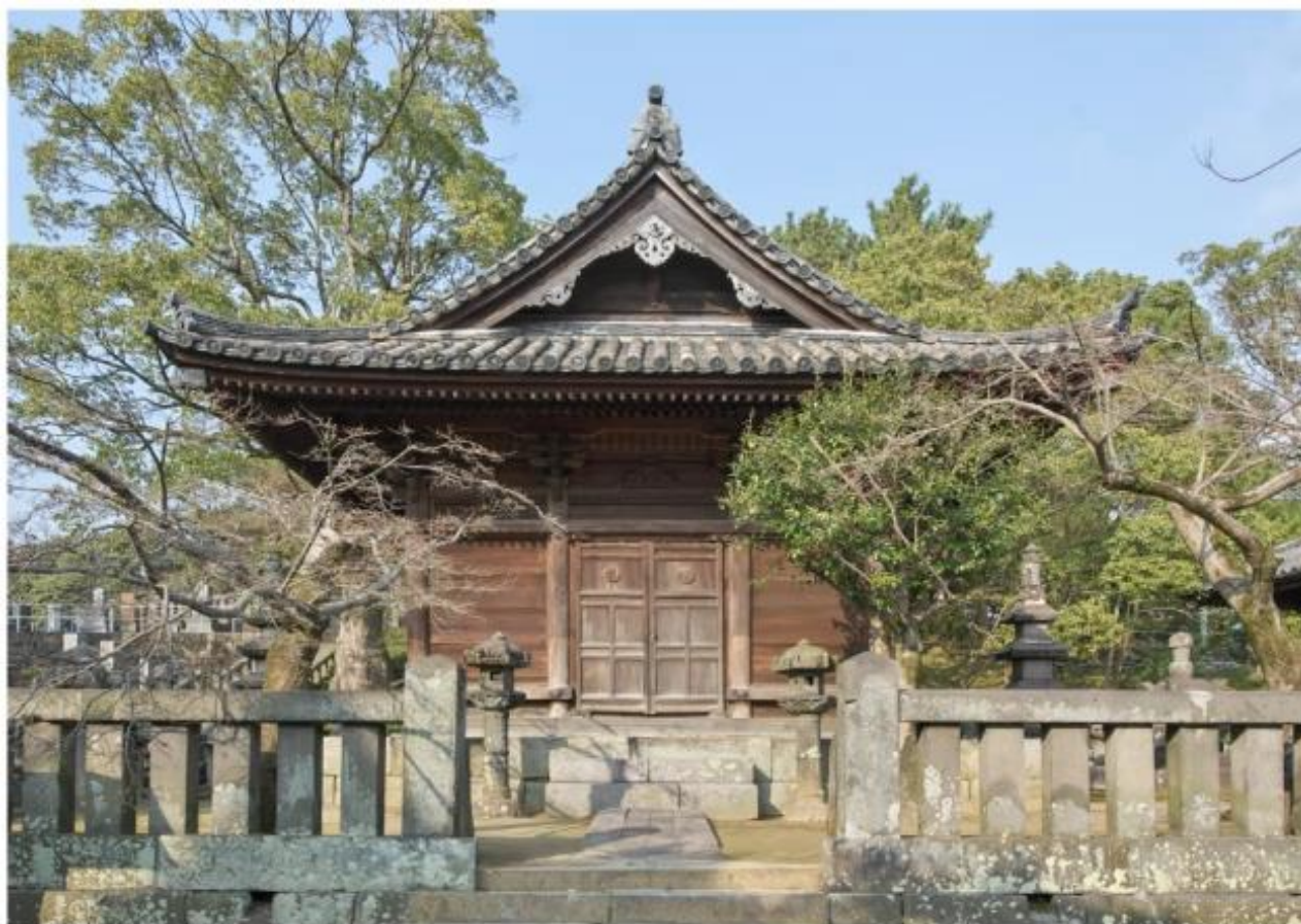
Bairin'in Ancestral Hall

In 1621, twenty years after the beginning of the Tokugawa Shogunate that lasted around 250 years, Arima Toyouji entered the Kurume castle as a lord of Kurume Domain in Chikugo Province (northern half of the province). His family ruled the domain until 1868 when the shogunate ended.