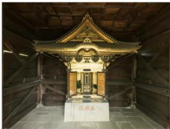
Mortuary Tablet in the Miniature shrine