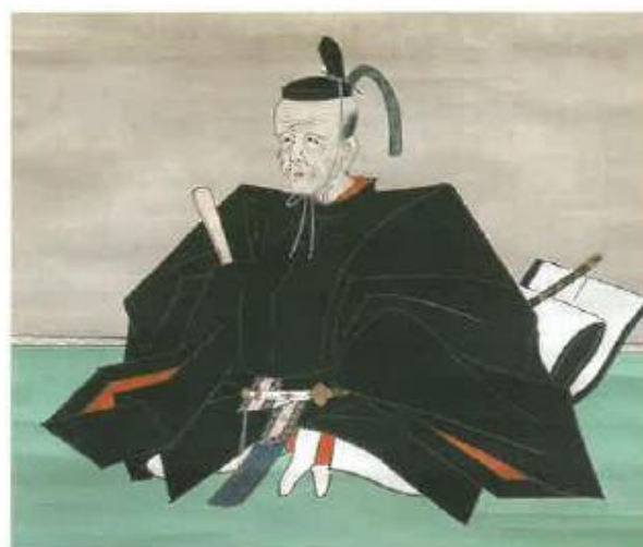
Arima Toyouji, the first lord (Collection of the Sasayama-jinja Shrine)