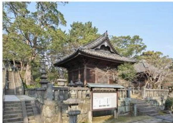
Bairin'in Ancestral Hall (foreground) and Shunrin'in Ancestral Hall (background)