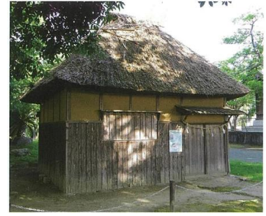
Replicated Kuchinashinoya House on the ground of the Suiten-gu Shrine * The original exists in Chikugo City.