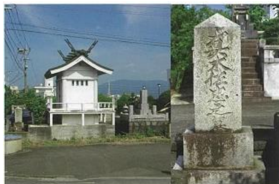
Maki family's grave