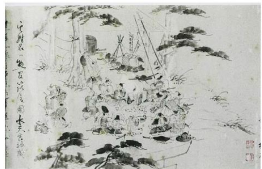
Scene of Suicide (Suiten-gu Shrine Collection)

Hamaguri Gomon Incident (or Kin Mon Incident) 蛤御門の変(禁門の変): On July 20th, 1864, the Choshu army fought with the Aizu and the Satsuma in Kyoto City. Especially near the Imperial Palace, heavy fighting occurred. Then, this event is called after the nickname of the Palace gates: "Hamaguri omon (Clam Gate)" and Kinmon (Forbidden gate). The former tried to eliminate the latter two that played a leading role in the political situation, however, that failed.