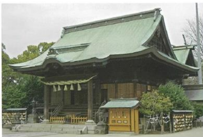
Main Hall of Suiten-gu Shrine