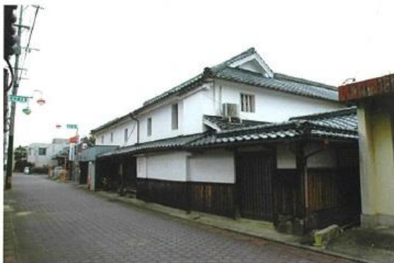
A street with buildings of the Edo period