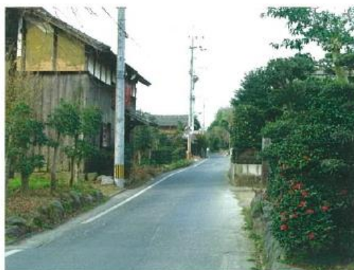
Nakamichi Okan Street (around Tarobaru)

Cultural Properties Protection Department of Kurume