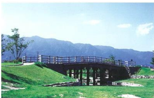
Ishiura Ohashi Bridge

Besides, there are several places with the atmosphere of that time on Nakamichi Okan Street in other towns of Kurume.