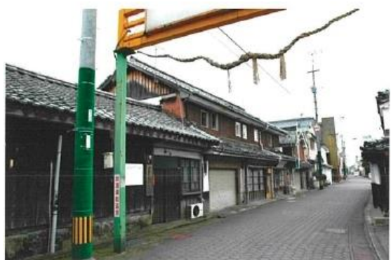
A street with buildings of the 20th Century