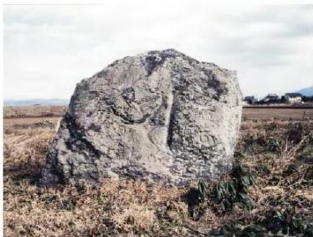
Yoshizumi Stone Monument ⑩