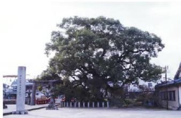
Camphor Tree ⑥