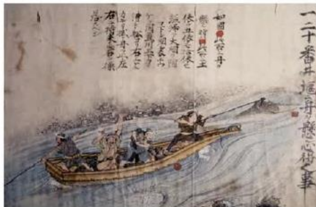
Illustrated history of the Tokoshima Irrigation Channel ⑪

Besides, there are three municipal cultural properties in the town.