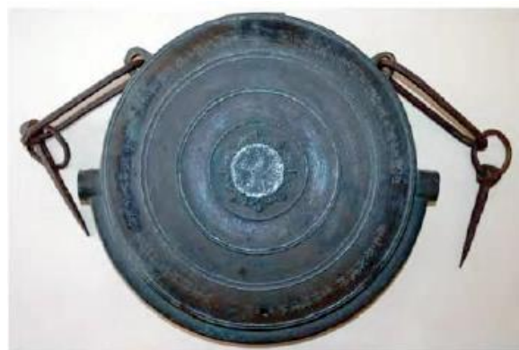
Bronze gong ⑧