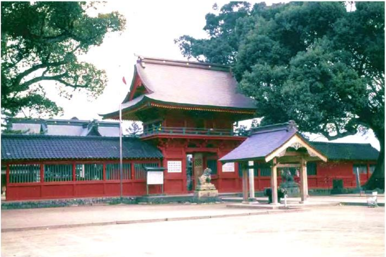
Main Gate of Kitano Tenman-gu Shrine ① *Figure in a circle indicates that of the map on the fourth page.

*Kitano Town, which had been an independent municipality, merged with Kurume City in 2005.