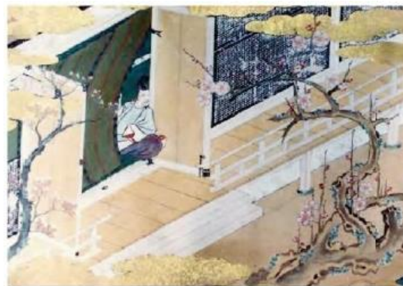
Illustrated Legends of Kitano Tenman-gu Shrine in Chikugo Province ⑦

- Jinko Festival is held on the third Sunday of October.