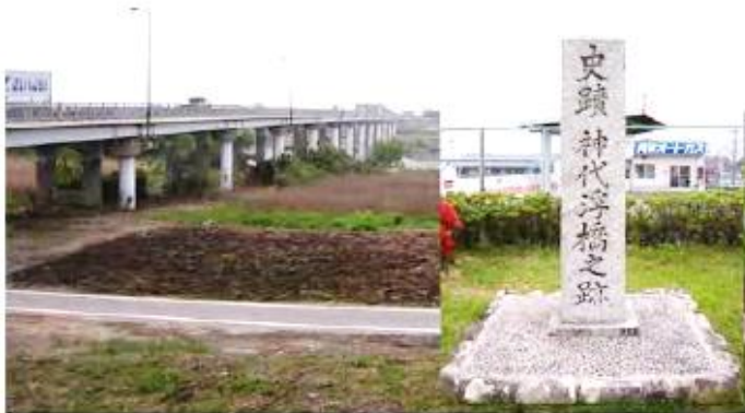
The former site of Kumashiro Pontoon ④