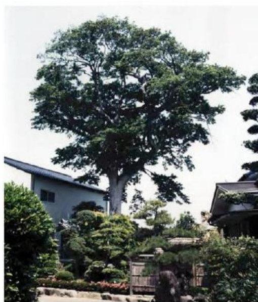
Mochi Tree ⑫

- Kurogane holly of the Kuroiwa family is about 400 years old, has a height of over 17 meters, and a trunk circumference of 3.16 meters.