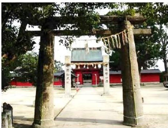
Stone Torii gate of Kitano Tenman-gu Shrine ⑤