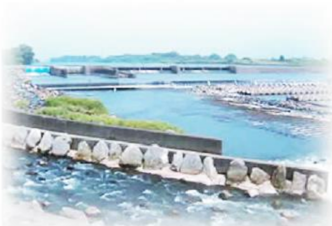
Tokoshima Irrigation Channel ②