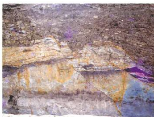
The clay wall was re-rammed after the collapse due to the liquefaction ( Kamitsu Dorui Ato in Kamitu)