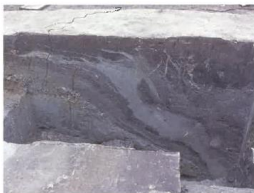
The trace of the liquefaction phenomenon and the sand boil phenomenon at the remains of ancient facilities of the national administration and the military ( Chikugo Kokufu in Aikawa)