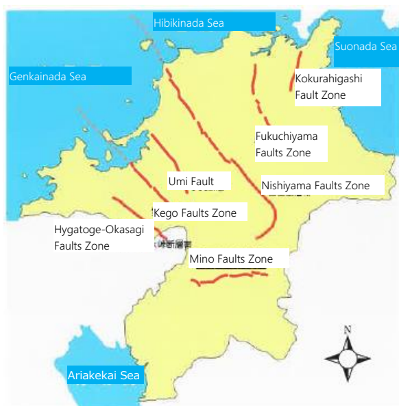
Main active faults in Fukuoka (Red lines)

Liquefaction phenomenon and sand boil phenomenon: When a sand layer with high water content is hit by a large earthquake, it becomes squishy (Liquefaction). Furthermore, if upon the sand layer there is a clayey layer that functions as the lid, the water, and the sand tear the clayey layer, and these spurt out to the surface (Sand boil). When the Niigata Earthquake occurred in 1964, some high-rising buildings broke down or leaned.