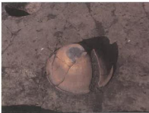
The cracks (black lines) tear a pit dwelling house and a bowl turned down on the floor in the Yayoi period (1000 BCE-300) (Higashigarasu remains in Yasutake)