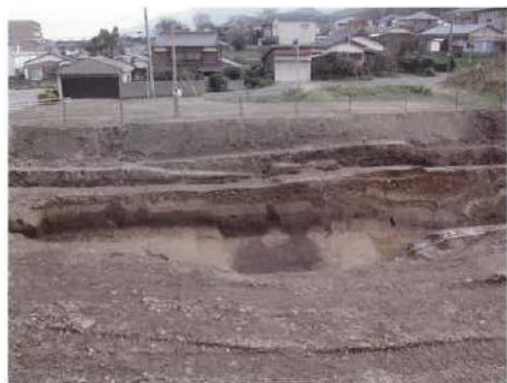
The sinking due to the crack (Shindo Remains in Mii-Hatazaki)