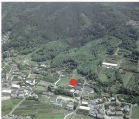
Yamakawa-Maeda Remains (The faults run along the edge of a mountain)