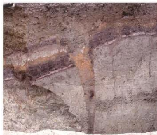
This crack in which a Haji pottery was unearthed is the conclusive evidence that was the source of the Tsukushi no Kuni Earthquake.