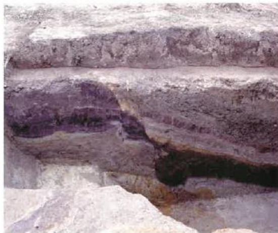
Slippage of the black humus layer and the orange AT volcanic ash layer.