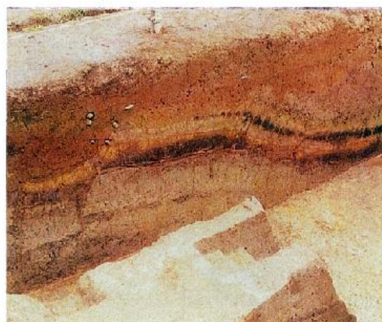
A humus layer that normally accumulates horizontally was greatly deflected.