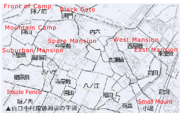
Administrative units and its names around the remains

The description of Kazusada’s book is as follows: