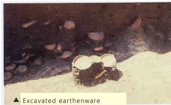
▲ Excavated earthenware

It is said to be a mansion of the Kondo clan. In the literature of the Kamakura period (1185-1333), the “Araki” clan appeared, but with the passage of time, the name became the “Kondo”. It is not known what the reason was. There are the documents, which indicated that these two clans were the same such as the genealogical chart and their terrain.